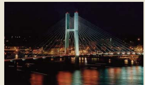
The Burlington skyline at night.